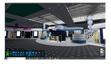
Figure 7. Lumion Program Application