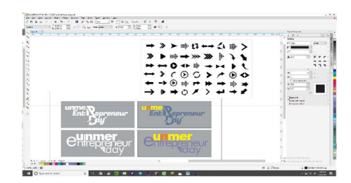
Figure 2. CorelDRAW Program Application

Unmer Virtual Exhibition Design is a technical stage of transforming concepts into visuals using several software, namely: a) Corel Draw is used in making: logo designs, icon designs, PNG format output; b) Adobe Aftereffect is used in making: logo animation, icon animation output in MOV Alpha format; c) Grassvalley Edius is used in making: animation video editing, video greeting editing, MP4 format output; d) Sketchup, used in making: modeling 3D objects, 3DS output format; e) 3DSMax is used in making: finishing modeling 3D objects, 3D object layouts, material ID, FBX format output; f) Lumion, used in making: Layout 3D objects, Giving other 3D assets, texturing, coloring, lighting, setting panoramas, output JPG format.