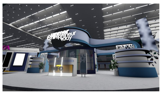
Figure 9. Unmer Virtual Exhibition Rendering Visualization