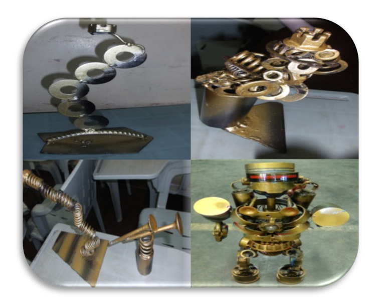
Output of the Bachelor in Technology Teacher Education students out of internal parts of automobile engine scrap.

Output of the Bachelor in Automotive Technology students out of motorcycles scrap.