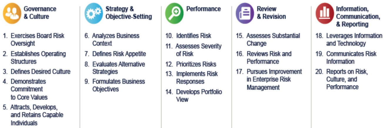
Figure 2: Twenty principles under five components of the COSO (2017) framework

Five interrelated components of COSO 2017 model covers a set of 20 principles under naming 1) governance and culture, 2) strategy and objective setting, 3) performance, 4) review and revision and 5) information, communication, and reporting.