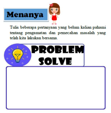
Figure 3: Appearance at the "Asking" Stage

Furthermore, from the results of observations and problem solving that have been carried out in the previous stages, at this stage students are invited to ask questions that they have not yet understood. The questioning stage contains activities for writing questions that students may have. The following is an example of a screenshot in the questioning stage.