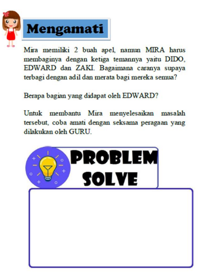
Figure 2: Display in the "Observing" Stage

Furthermore, from the results of observations and problem solving that have been carried out in the previous stages, at this stage students are invited to ask questions that they have not yet understood. The questioning stage contains activities for writing questions that students may have. The following is an example of a screenshot in the questioning stage.