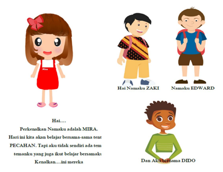
Figure 1: Introducing Figure in a Problem-Based Interactive Module

The Problem Based Interactive Module produced by researchers is designed by using figures which are also used in problem based interactive multimedia in previous studies. Following are some of the figures used in the problem-based interactive module.