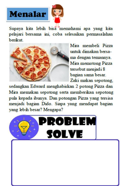
Figure 4: Display in the "Digging Information" Stage

That way, students will try to reason the fraction abilities that they get from interactive multimedia that they have listened to. He must also look for problem solving from the given problem.