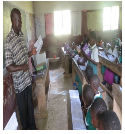
Figure 2: One of the Reading Lessons from Omuto Yiga (Babirye, 2011)

Both teachers from UPS and one teacher from SUPS had pre-set questions for pupils to answer after reading the story. Those from RPS and one from SUPS randomly asked questions from the story as they wished. As a result, teachers who had pre-set questions were better prepared and their questions flowed chronologically from the beginning to the end of the story unlike the questions of their counterparts which were randomly set from various parts of the story. All teachers motivated their pupils as they answered the questions. The motivation encouraged pupils to be active throughout the lesson.