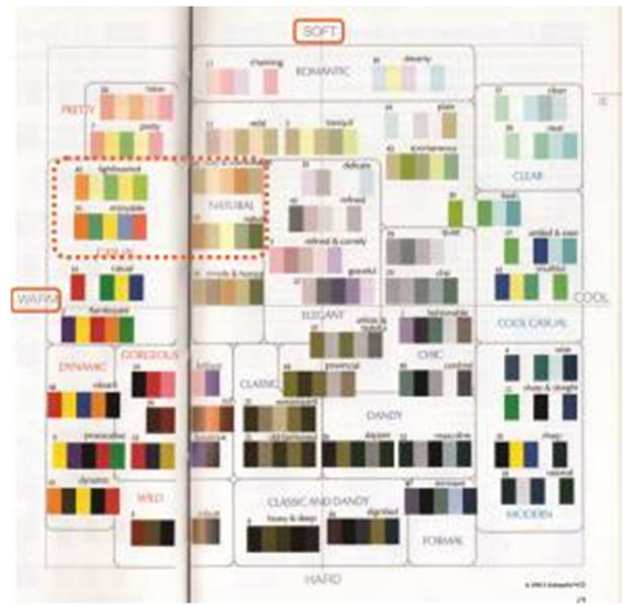
Chart 1. Color Theory of Shigenobu Kobayashi

According to color theory Shigenobu Kobayashi, warm and soft pick some characteristics that is pretty, casual, natural. The author chose the character of casual and natural colors for use in interior design museum mangrove.