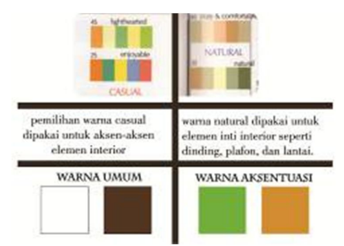
Chart 2. Selection of colors according to the theory of Kobayashi

According to color theory Shigenobu Kobayashi, warm and soft pick some characteristics that is pretty, casual, natural. The author chose the character of casual and natural colors for use in interior design museum mangrove.