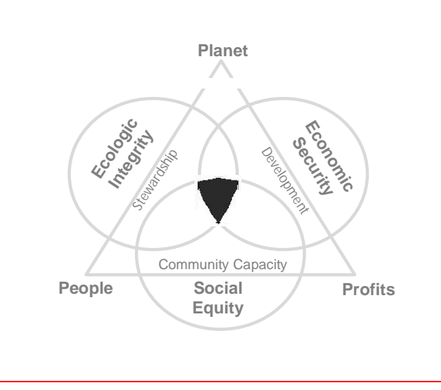
Figure 1. Sustainability Symbolism. Adapted from "Symbolism of Sustainability: Means of Operationalizing the Concept," by Flint, 2010. Synesis: A Journal of Science, Technology, Ethics, Policy, 2010, volume 1, p. 33. Reproduced with permission.

development. The triangle is incomplete to show that "human potential is a work in progress." (Flint, 2010).